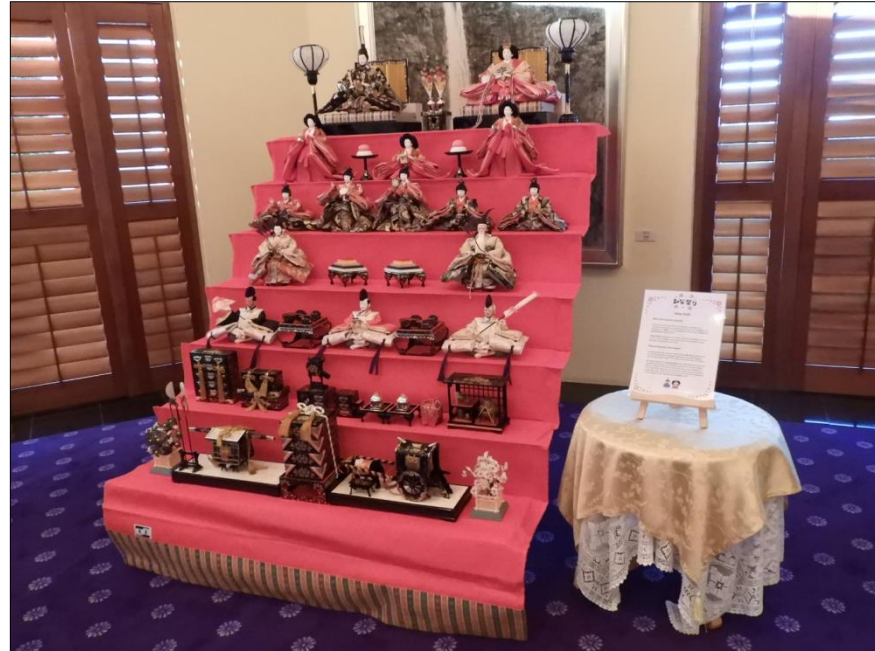
A display of Hina Dolls at the Official Residence

The third of March every year is Hina Matsuri, also called Girls Day or Dolls Day. It's a special day to commemorate the growth, happiness, and prosperity of young girls, and corresponds to the beginning of spring when peach blossoms start to bloom.