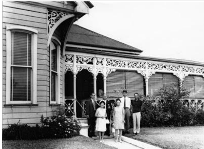
The Japanese Consul, with his family and staff, outside the former Japanese Consulate at 11 Victoria Street, Stanton Hill, Townsville c.1970

We would like to thank the Queensland Japanese community and all Queenslanders for your long-standing support, and look forward to many years of strong relations to come.