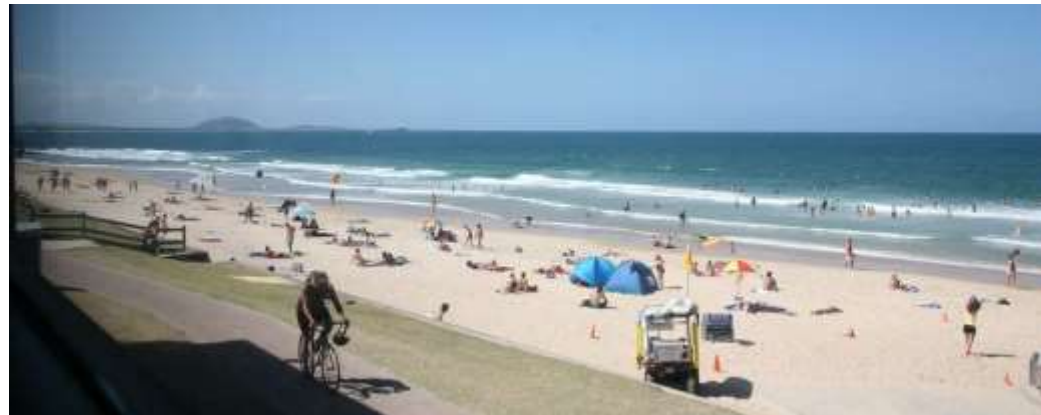
Images "sunshine coast" by Bertknot and "Gunma Museum of Art, Tatebayashi" by Naoyafujii.