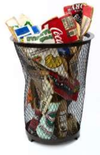
Kimiyo Mishima, Japan b. 1932 / Work 19 – G 2019 / Silkscreen and hand-painted on ceramic, iron / 91 x 57 x 58cm / ©Kimiyo Mishima, Courtesy of the artist and MEM, Tokyo

For more information, visit: https://www.qagoma.qld.gov.au/whats-on/exhibitions/apt10