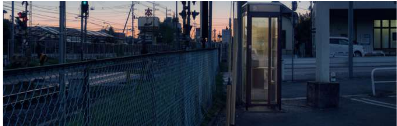
Image credit: Calling (Japanese version) by Masaharu Satō, 2014. © Estate of Masaharu Satō. Courtesy of Mihoko Ogaki, imura gallery and KEN NAKAHASHI Gallery.

“Compassionate Grounds: Ten Years on in Tohoku” is an exhibition of Japanese screen-based artworks that respond to the disaster and the transformed landscapes that represent irreversible loss and displacement.