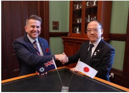
Consul-General Ishikawa with The Hon. Jarrod Bleijie MP.