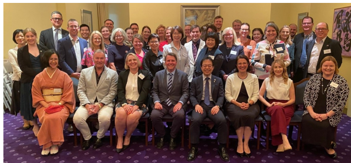
Image: attendees at our Language Education Reception on May 31

It is an exciting time to be learning Japanese, with ever-growing opportunities to connect through pop culture, sister school agreements, and even visiting Japan! We hope to see Australian students continue to engage closely and discover the huge range of Japan careers across ties in education, business, trade, government, security, sport, and culture. To learn more, we encourage you to take part in some of the upcoming events held right here in Queensland.