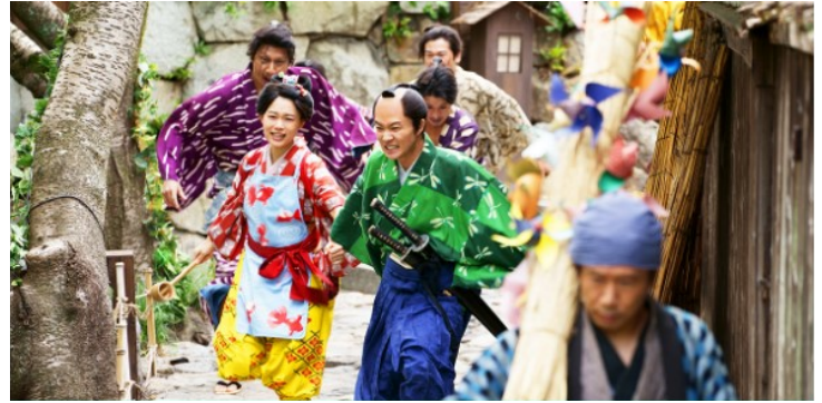
Image: Japanese Film Festival Opening Film "We're Broke, My Lord!".

As the weather warms up, we have also been able to enjoy the spring air and flowers, including at AJS's recent Night in the Gardens at Mt Coot-tha, which featured a range of Japanese performances, and at JETAA's upcoming Hanami (flower viewing) picnic under the jacarandas on 22 October. We hope you are enjoying the sunshine!